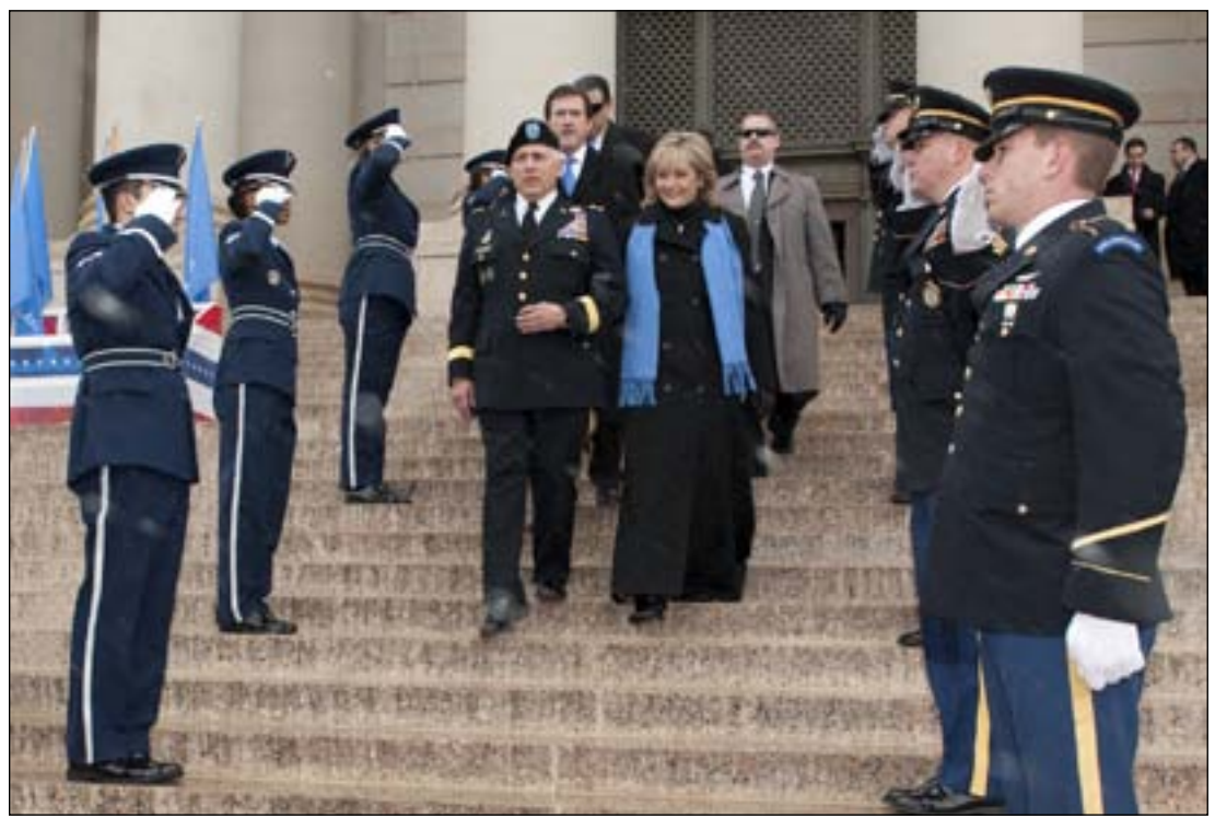
Oklahoma Air and Army Honor Guard members salute incoming Governor Mary Fallin during the official inauguration at the Oklahoma State Capitol, on Jan 10, 2011. Other Honor Guard members provided the flag detail and firing party for the ceremony.