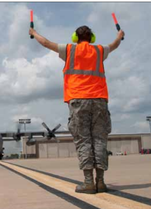
ed to the 137 ARW, marshals in the last base flight line June 16. During the ORI respond quickly to simulated accidents ly care, deal with other war simulations, as of their base area.