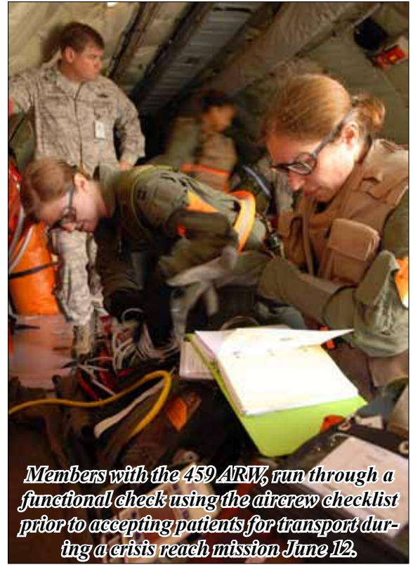
Members with the 459 ARW, run through a functional check using the aircrew checklist prior to accepting patients for transport during a crisis reach mission June 12.