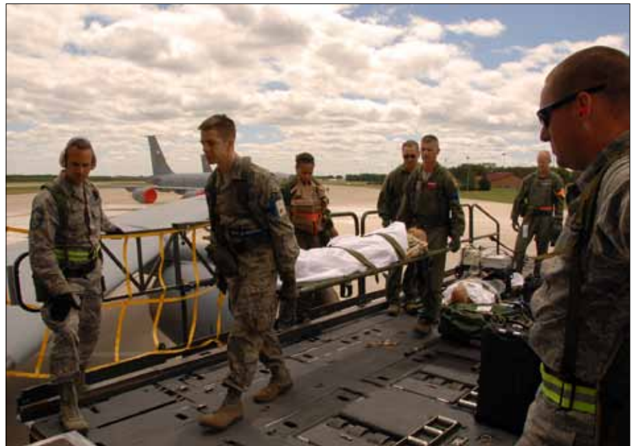
Members from the 137th, 459th and 507th Air Refueling Wings work to load patients and equipment for transport during an exercise crisis reach mission June 12, at the 124th Air Expeditionary Wing in Alpena, Mich. The 137th, 459th and 507th Air Refueling Wings joined forces for the operational readiness inspection.